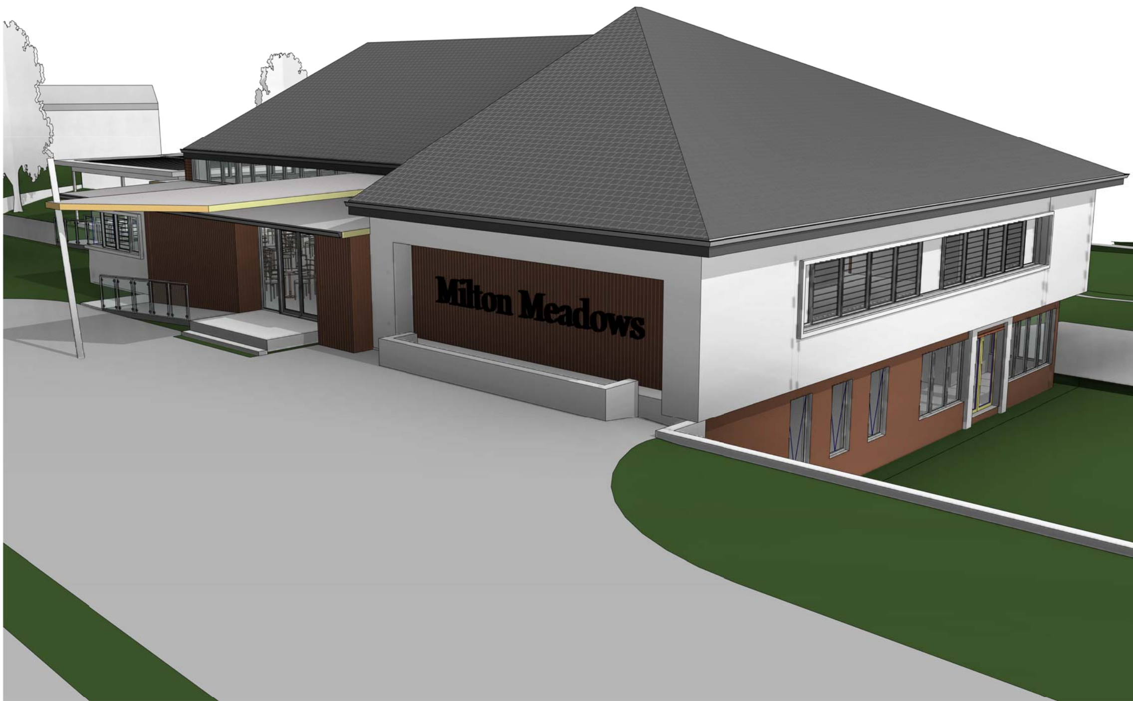
3 view 7